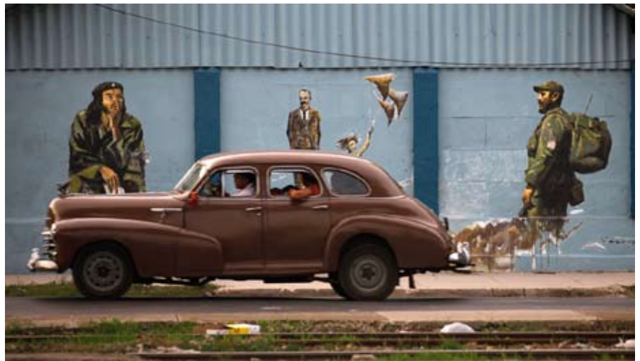
Cuba circa 2000... Cuba does not exhibit mainstream consumerist patterns of life.