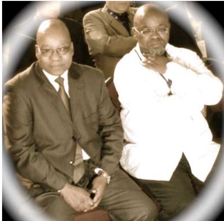
Without Gwede Mantashe's paranoid response (see box) the COSATU/Civil Society conference may be relegated to the media wilderness.

W HILE NOISE HAS BEEN made regarding the ANC's reaction to COSATU holding a conference with civil society organisations to which it and other Alliance partners were not invited, not much information and analyses have been forthcoming on the conference itself. Amandla! was invited to the proceedings and offers an overview.