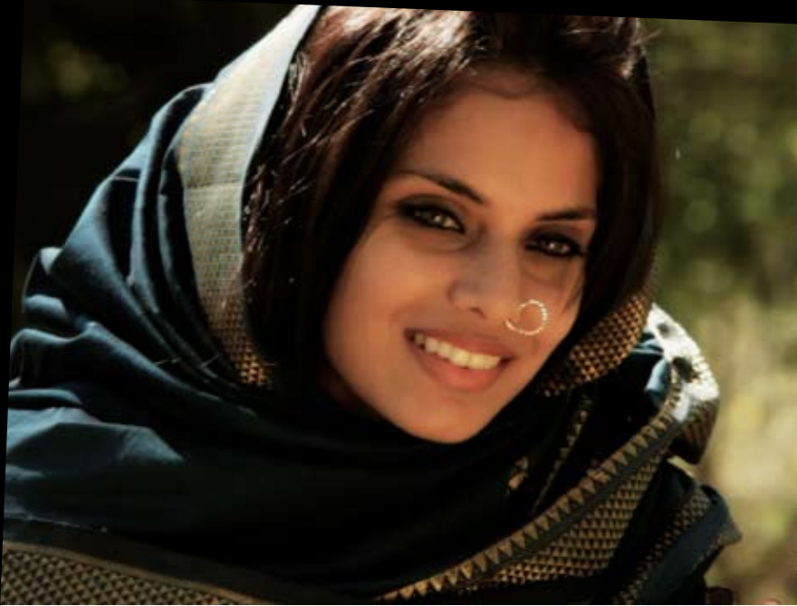
White Gold tracks the migration of Indian indentured labour.

W HEN WALKS AND watermelon, the beach and parties become too much over the summer holidays, press play and watch Amandla! Best Choice holiday doccies and movies