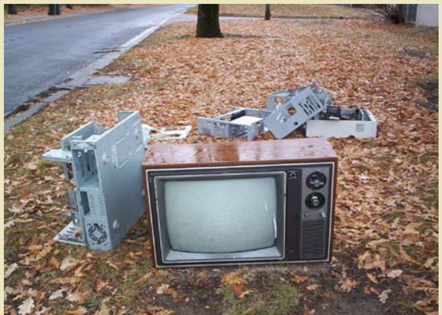
We are witnessing the final, terminal crisis of capitalism.