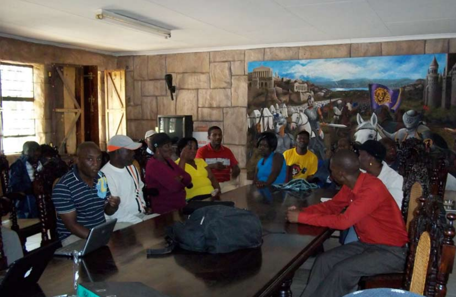
Mine-line workers meet to discuss the occupation of their factory.