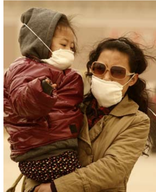
Woman and child wearing masks – Living in polluted industrialized Chinese cities has meant adapting to a ‘new normal’.

In Beijing, driving restrictions that removed a fifth of private cars from roads each weekday have been offset by 250,000 new cars that hit the city streets in the first four months of 2010.