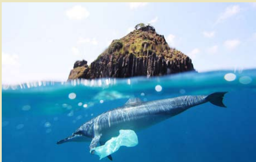
Capitalism is rapidly destroying its life support systems.

THE TOP-DOWN VISION ON CLIMATE issues deals with global averages, not with the way people and communities