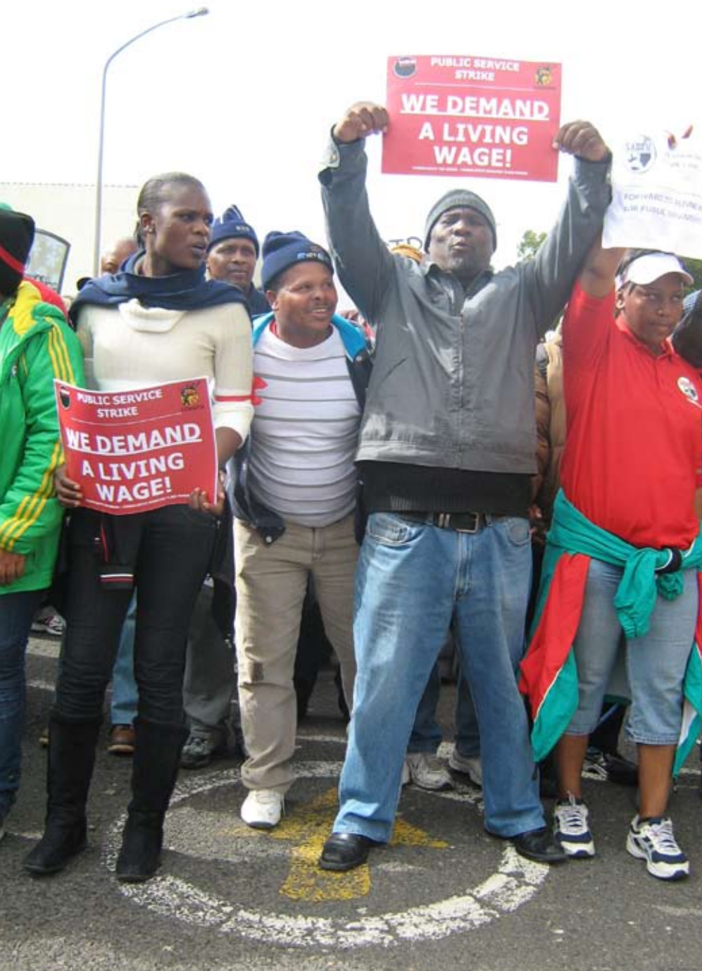
The shift in the balances of forces in economic terms in the last 10 years have meant that that workers have lost R412 billion to the bosses says the author.

the document are energy intensive and have a high propensity for environmental destruction. Ecological activists have to step in here and give us an economic assessment, on the viability and possibility of organic farming and many other issues and alternatives, all of them having to do with the protection of life.