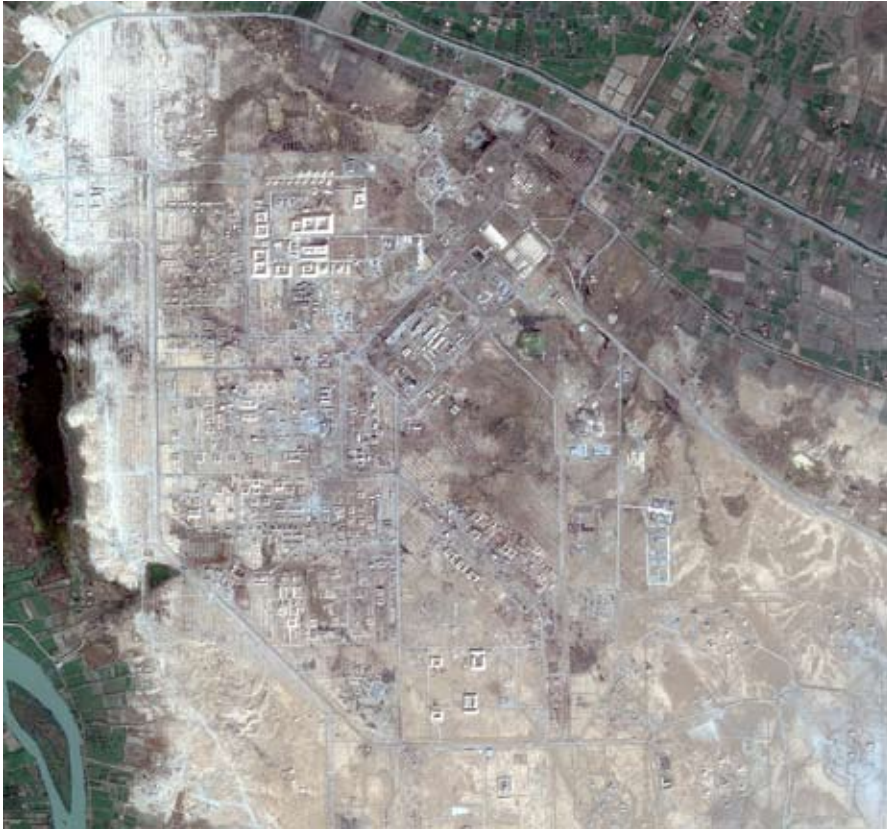
Satellite image of Iran