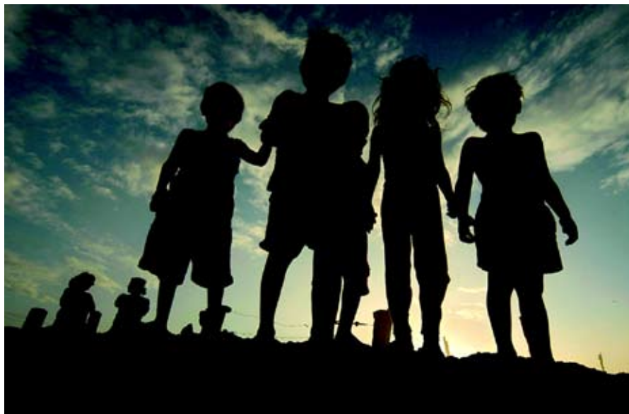
A "naturalised" social order is established, which prescribes rules and patterns of conduct.

Visit www.amandla.org.za for a complete bibliography.