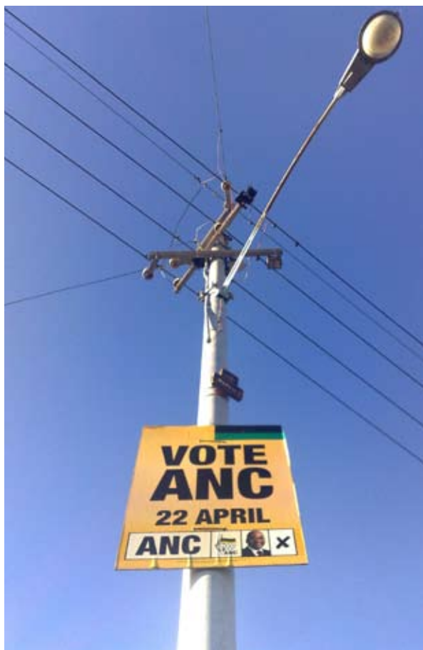
If the ANC really wishes to emancipate the country's Black majority it must forge a movement which can counter White capital, say the authors.

unabashedly than before. And today, in all too many countries it continues to serve the very financial capital that it served under neoliberalism over the past three decades. This should tell us that ending neoliberalism is as much a political as a policy matter.