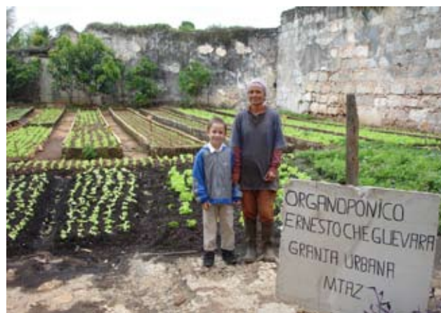
Cuba has transformed its agriculture from fossil fuel dependant to organic farming.

IN THE LONG RUN, RENEWABLE resources are substituted by nature itself through natural growth and regeneration. You can express the cost of using such resources in quantitative terms. Loss of non-renewable resources however cannot be expressed quantitatively. Biodiversity will not be substituted if a hectare of jungle is replanted by a hectare of new commercial and exploitable forest. You have to count as well the loss of flora and fauna in general which can only prosper in a primary forest. It means a loss for present and future generations that cannot be replaced. In the same way is it hard to count the costs of the consumption of non-renewable resources like oil and petrol. If one had to quantify