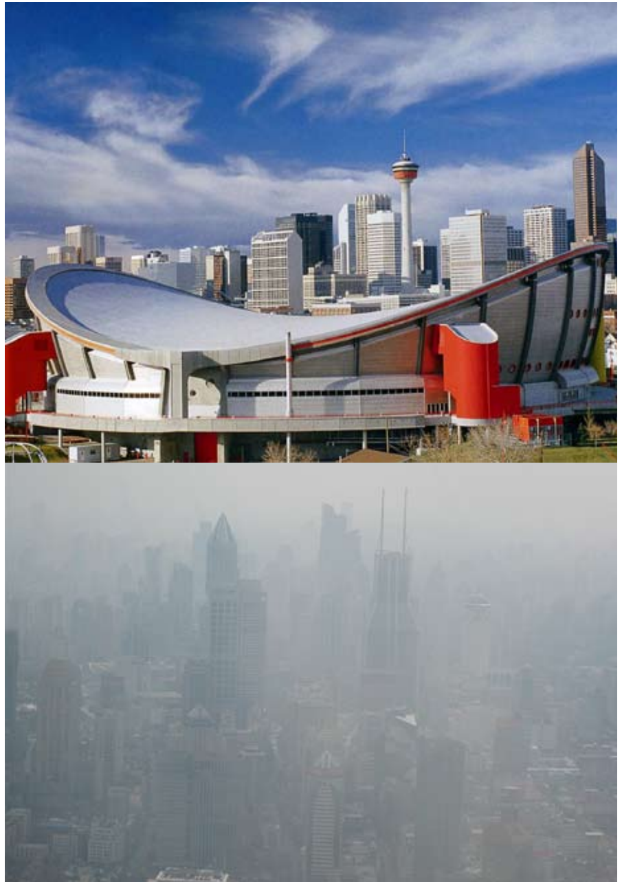
Calgary (top) 2010 and Shanghai (bottom) 2010: a more respectful attitude towards nature places the economy in function of life and not in opposition to life.

AND SO WE CAN SKETCH A POSSIBLE post-capitalist non-growth utopia of global equality. The annually produced output may fall because total conserved output from previous periods is rising. As production cycles are repeated less and less frequently, leisure time is