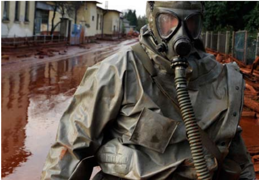
War is also about blood for food, blood for genes...for biodiversity and water.