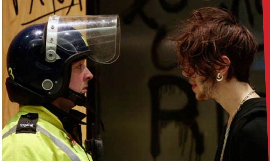
UK police and student face-off.