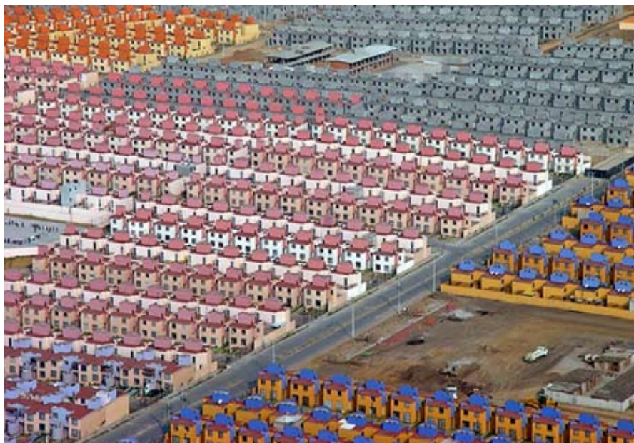
“urbanity is collapsed to the simple construction of housing, not neighbourhoods”

Vandana Shiva is a philosopher, environmental activist, and eco feminist. Shiva participated in the nonviolent Chipko movement during the 1970s. The movement, some of whose main participants were women, adopted the approach of forming human circles around trees to prevent their felling. She is one of the leaders and board members of the International Forum on Globalization